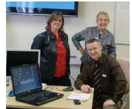
Our web administrators training day